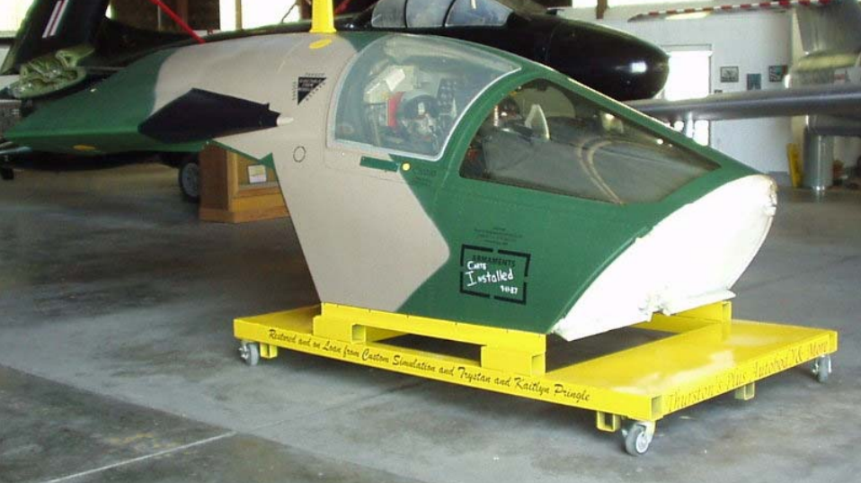
Above: One of the mannequins inside the F-111 capsule. Right: The F-111 crew escape capsule on its stand.

Initially, an Air Force selection board and a Navy representative recommended the Boeing design, but the Air Force council rejected it. By late January 1962, the Air Force and Navy agreed none of the contractor proposals were acceptable, but the Boeing and General Dynamics designs warranted further study. By now the TFX had become the F-111A for the Air Force and the F-111B for the Navy.